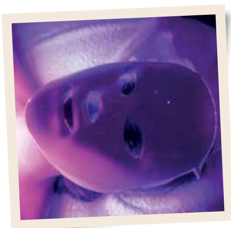
Rowland in an LED mask as featured in an O, The Oprah Magazine Instagram post. “How crazy is this mask that @shanidarden put me on to???” she wrote.

3 Days Out “Get plenty of rest. Schedule a laser facial [$2,900-$5,900]. Get a lot of water into your system and sleep with a humidifier next to your bed.” —H.M.